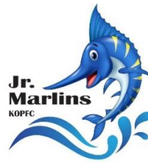
Pre-Comp: Jr. Marlins