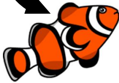
Level 1: Clownfish