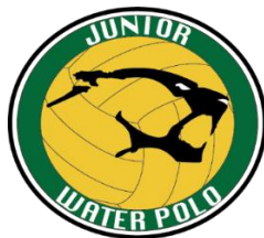
Pre-Comp: Jr. Polo