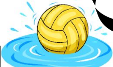
Level 1: Splashball