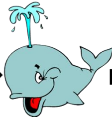
Level 6: Whale