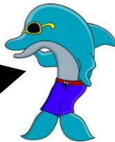
Level 5: Dolphin