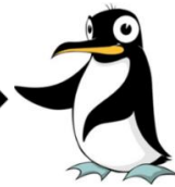
Level 4: Penguin