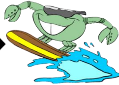
Level 3: Crab