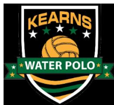
Kearns Water Polo Club