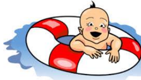
Water Babies Level 1 6-18 Months